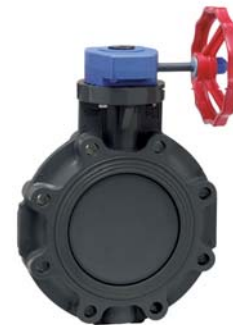
Gear Operator Style

Pressure Rating @ 73°F (23°C), Water 1-1/2" - 12" 150 psi Maximum Service Temperature PVC = 140°F (60°C) CPVC = 200°F (93°C) Temperature/Pressure De-ratings Apply See Butterfly Valve Accessories & Repair Kits Section for Additional Options and Features