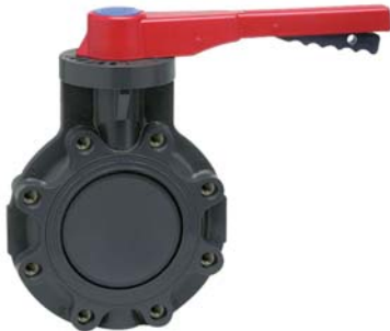
Lever Handle Style

Pressure Rating @ 73°F (23°C), Water 1-1/2" - 12" 150 psi Maximum Service Temperature PVC = 140°F (60°C) CPVC = 200°F (93°C) Temperature/Pressure De-ratings Apply See Butterfly Valve Accessories & Repair Kits Section for Additional Options and Features